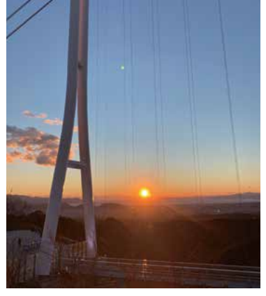
Spaced suspension cables (vertical cables) are an innovation enabling an excellent view.