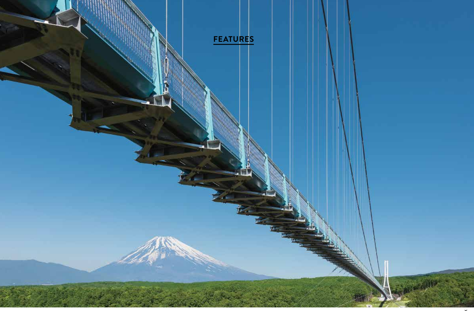
A breathtaking view of Mount Fuji seen from Mishima Skywalk.