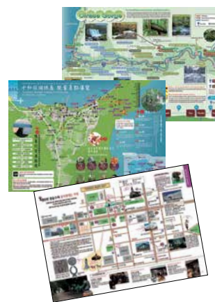
Above: Guide map of the Oirase Gorge in English

Towada City is a captivating place where the forces of nature and human creativity come together, and where the beauty of both can be experienced firsthand. Towada City is one place that is not to be missed. ▼