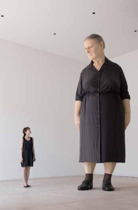
Left: Visitors are overwhelmed by the intricately crafted figures. On the right is the work “Standing Woman” (height: approximately 4 meters) by hyperrealist sculptor Ron Mueck. On the left is an actual person for comparison.