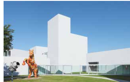
Visitors are greeted by Choi Jeonghwa’s artwork “Flower Horse” (height: 5.5 meters). The street where the art museum is located represents Towada City’s historical connection with horses, coming from the facility’s past involvement in raising and supplying military horses.