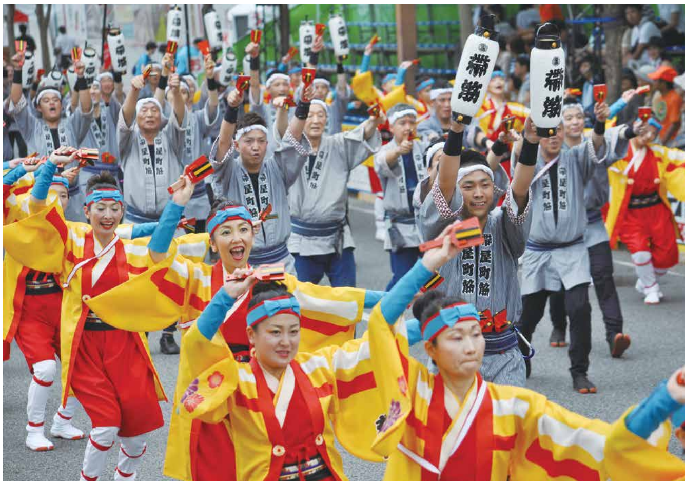
After a four-year interval, the Yosakoi Festival is coming back in 2023, and the locals are getting excited about it.

The Yosakoi Festival got its start in 1954 as a proposal from the Kochi Chamber of Commerce and Industry. The first festival featured dances based on a traditional Japanese dance to the tune of “Yosakoi Naruko Odori” (which is based on the folk song “Yosakoi Bushi,” and still the designated song of the festival), but the dances and the music have evolved and diversified over the years. The music has developed